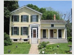
Victorian Christmas Tea