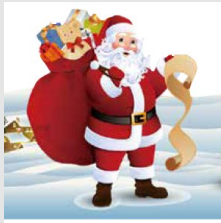
Breakfast with Santa!!